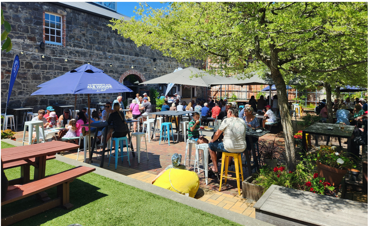
Outdoor area at Speights Ale House on a cruise day 2022/23