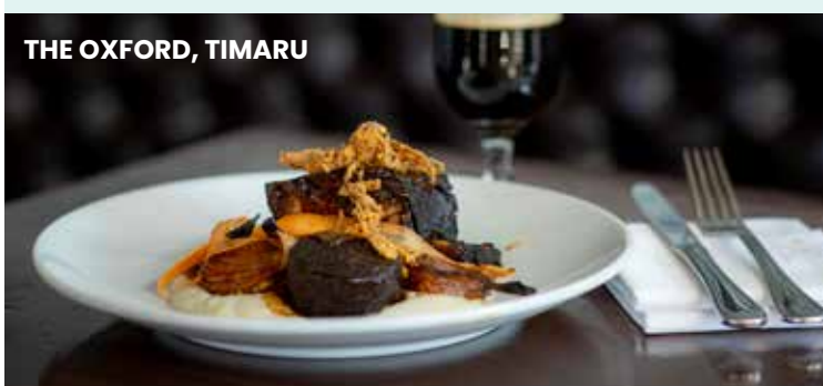
THE OXFORD, TIMARU

Our food producers are renowned for their innovation, from iconic brands like Barker's, to boutique artisan products that locals love and visitors are finding out about.