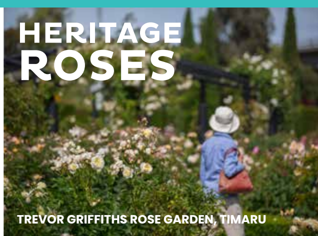
TREVOR GRIFFITHS ROSE GARDEN, TIMARU