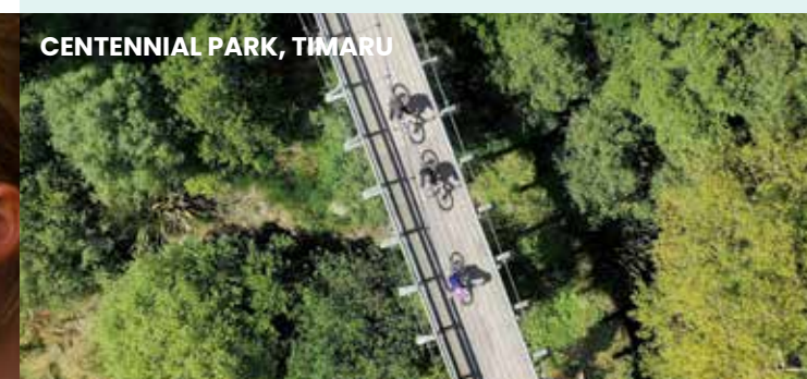
CENTENNIAL PARK, TIMARU

There's so much to do here for families and a lot of the best activities are completely free. Explore our tracks, go stargazing, find a 'WuHoo' and heaps more.