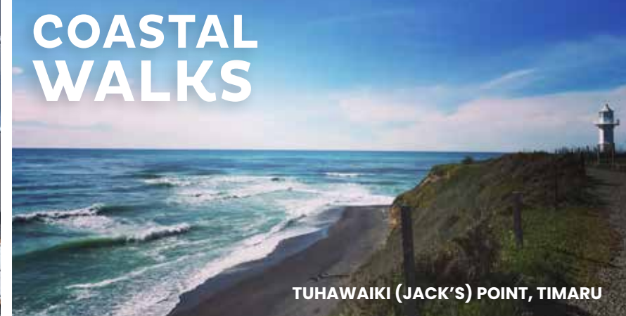
TUHAUAIKI (JACK'S) POINT, TIMARU