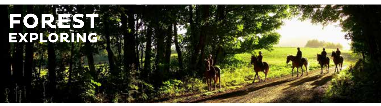
KORYU'S DREAM, GERALDINE