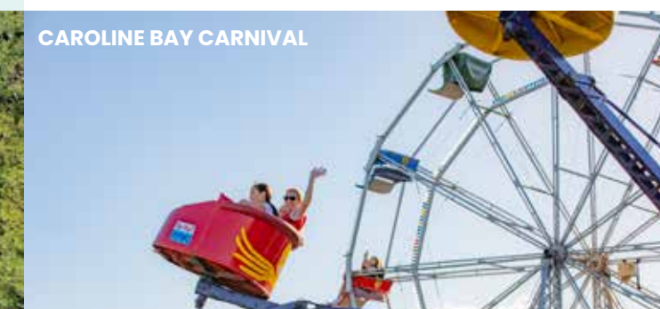
CAROLINE BAY CARNIVAL

We've got lots to celebrate in Timaru District. From large annual events to free community events, you'll find it all on the event calendar on our website.