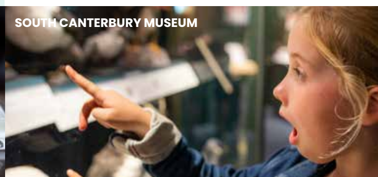
SOUTH CANTERBURY MUSEUM

There are 11 museums to visit, fabulous art galleries, and download the Timaru Trails app to explore art, heritage and tales of the Timaru cemetery.