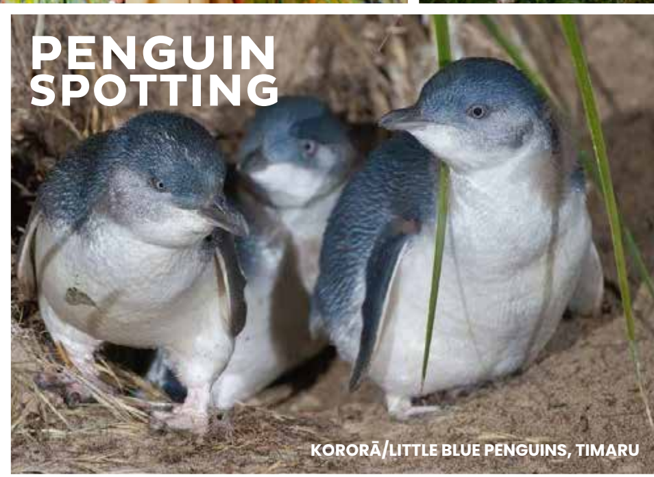
KORORĀ/LITTLE BLUE PENGUINS, TIMARU