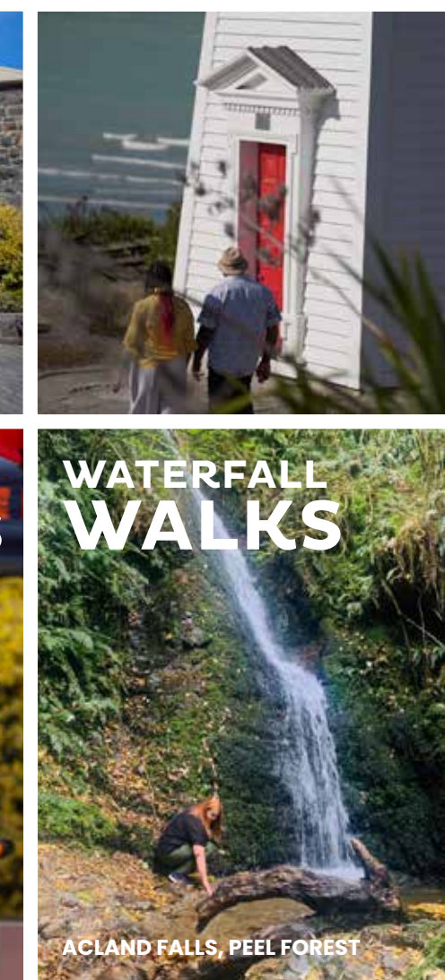
ACLAND FALLS, PEEL FOREST